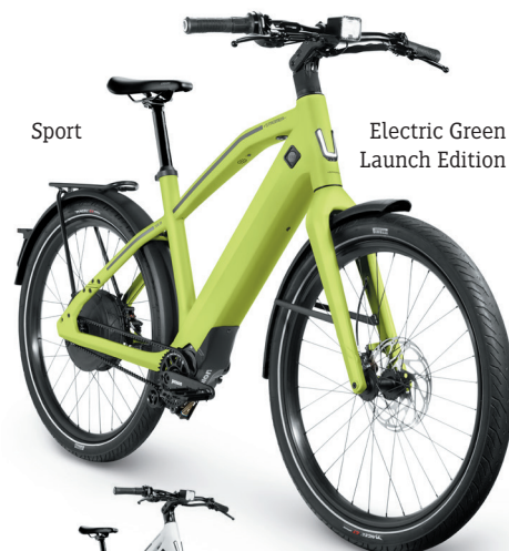
Sport Electric Green Launch Edition