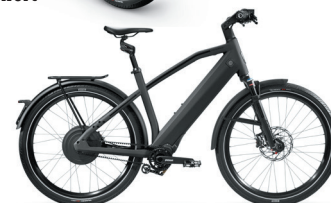
Sport, Suspension Fork & Suspension Seatpost Kinect