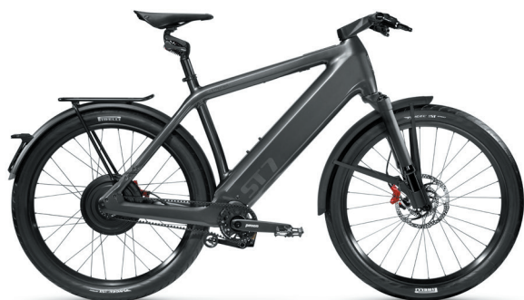
ST7 | Suspension Fork 27.5" Deep Black & Suspension Seatpost Kinekt

All prices incl. VAT, recommended retail price. Country-specific deviations are possible. myStromer AG reserves the right to change technical data and prices. All prices not including dealer labor.