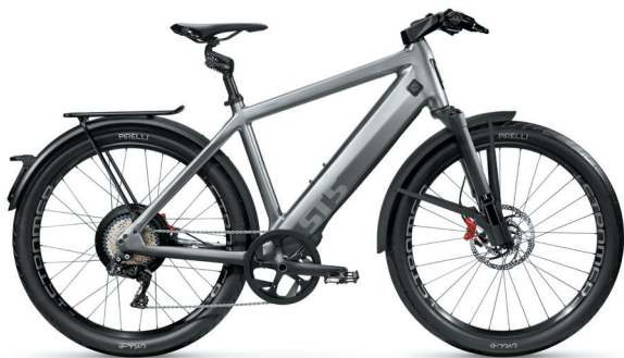
ST5 | Suspension Fork 27.5" Deep Black & Suspension Seatpost Kinect