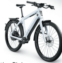
Option Pinion (see separate tech sheet)