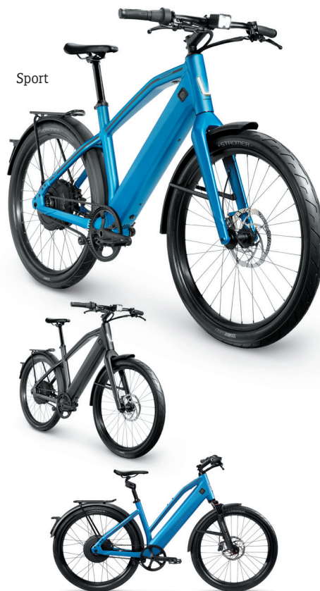
Comfort, Suspension Fork 27.5" Raidon Black & Suspension Seatpost Kinect